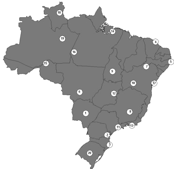
Fig.3: Location map of the measurement sites used to generate TMY series.

presents a short description of all available information to be use in GIS components of the SWERA project. The database available for implementation of GIS tools is being made in cooperation with several national agencies such as ONS, CEPEL, IBAMA, FUNAI, ANP, ANEEL, ELETROBRÁS, LABSOLAR and others.